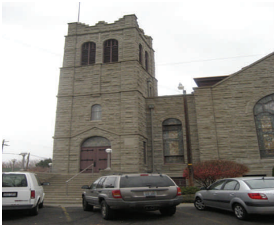
Pantry Shelf 325 S. 1st Ave.