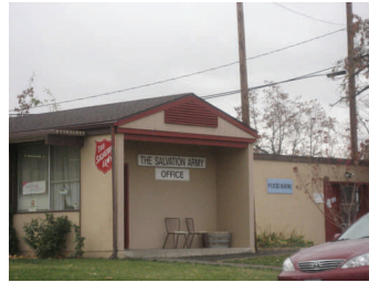
Salvation Army 827 W. Alder St.