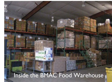
Inside the BMAC Food Warehouse

Shelf stable food such as canned tuna and pasta come to us from community food drives, USDA surplus food or direct purchase from 2nd Harvest using donated money. Fresh vegetables and dairy products are supplied by farmers and local gardeners. In addition, grocery retailers generously donate food throughout the year.