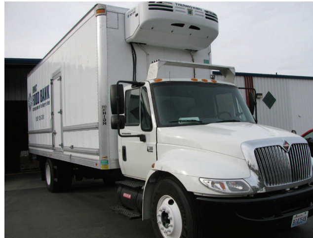
BMAC Delivery Truck...ready to roll!

Helpline 529-3377 16 S. Colville Street Walla Walla, WA 99362