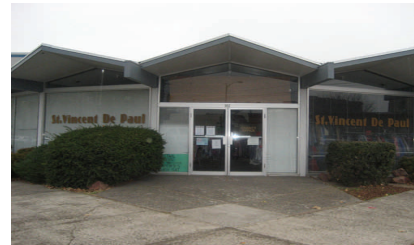
St. Vincent de Paul 308 W. Main St.